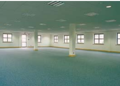
second floor offices shown

The ground floor of unit two is the last remaining suite in this attractive courtyard office development. Other occupiers include Huawei Technologies, Nexans and Adare Ltd.